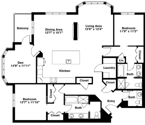
2 Bedrooms, Den, 2 Full Baths, 1 Half Bath (1,888 sq. ft.)