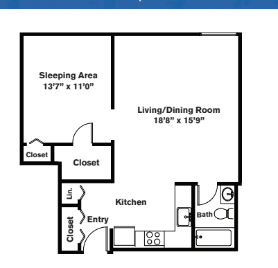
Studio ~ 1 Bath (740 sq. ft.)