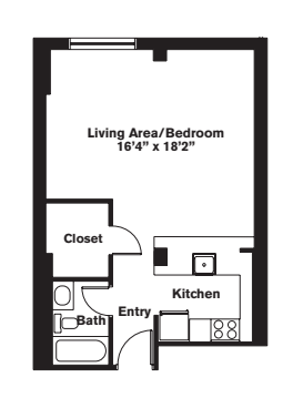
Studio ~ 1 Bath (541 sq. ft.)