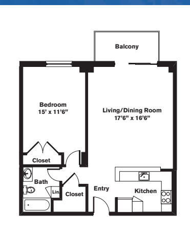
One Bedroom ~ 1 Bath (850 sq. ft.)