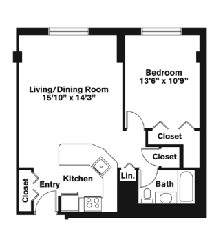
One Bedroom ~ 1 Bath (720 sq. ft.)