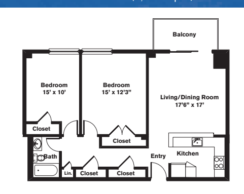
Two Bedrooms ~ 1 Bath (1,125 sq. ft.)