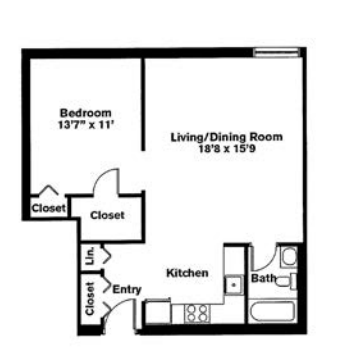
One Bedroom ~ 1 Bath (740 sq. ft.)