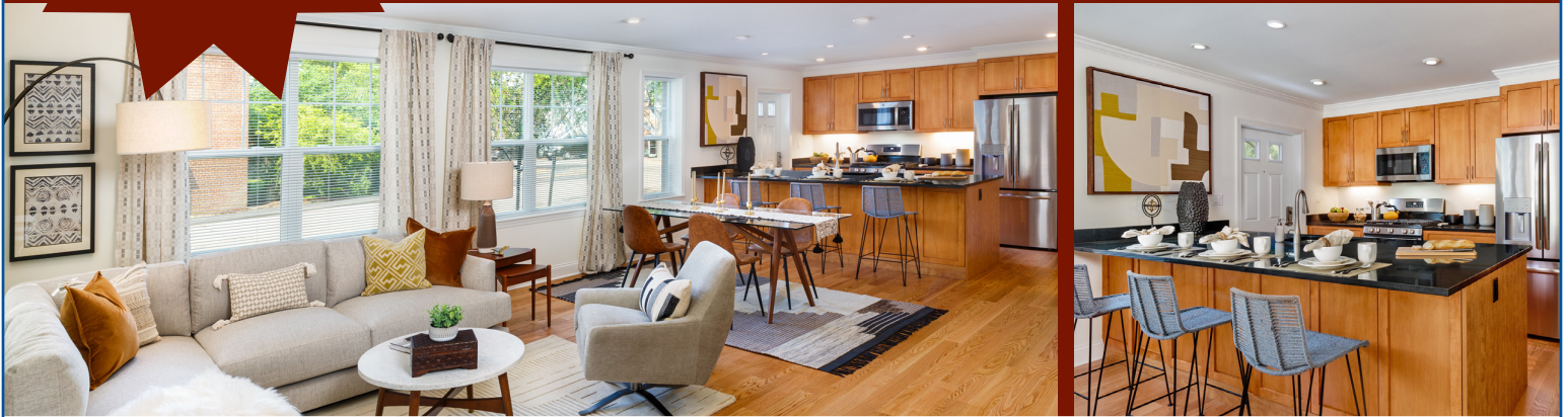
Photos are for representation purposes only. Variations may occur in the actual apartment home.