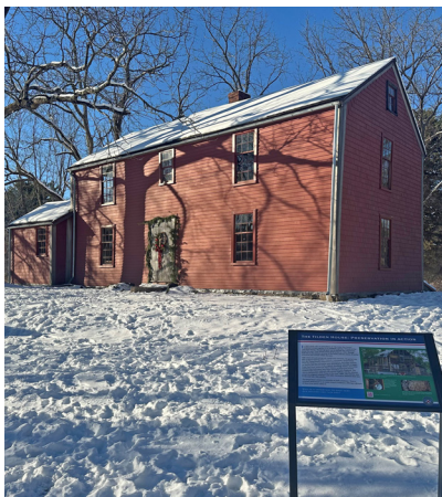
The Tilden House