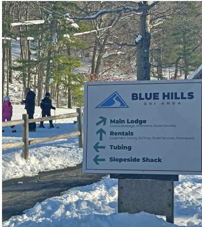
Blue Hills Reservation / Ski Area