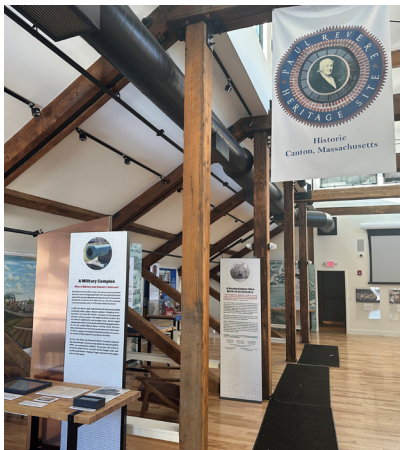
Paul Revere Heritage Site